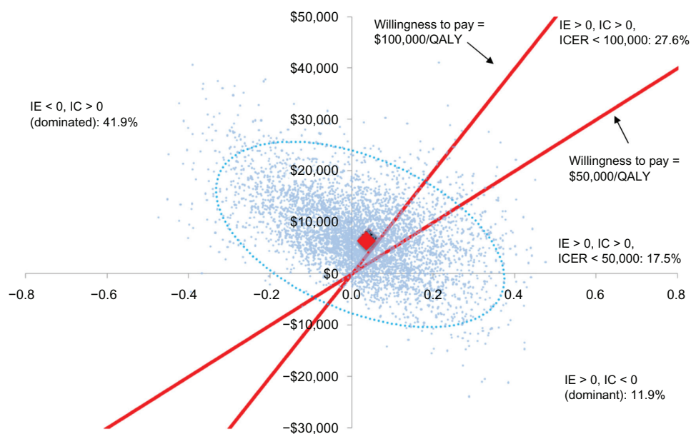
Figure 4 Probabilistic sensitivity analyses. a

derived from patients who also had less severe events. In this way, our model may have underestimated the quality of life decrement associated with adverse events; because the extent of bias could vary between events and therefore regimens, it is unclear how this may have impacted model ICERs.