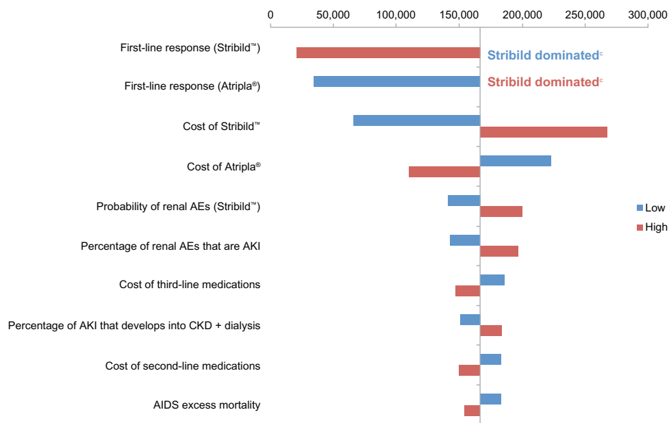
Figure 3 One-way sensitivity analyses. a,b

Notes: a Incorporating 3% annual discount rate for cost, LY, and QALY outcomes. Results expressed in $/QALY for Stribild™ compared with Atripla®; b all parameters were varied by ±10%; c Stribild™ had higher costs and lower QALYs than Atripla®.